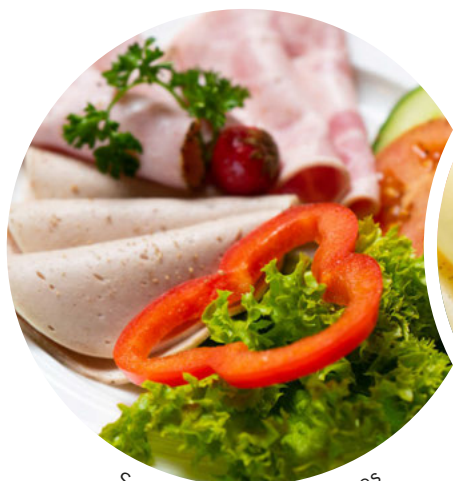
Serving of sliced sausages

All coffee and espresso varieties also available decaffeinated.