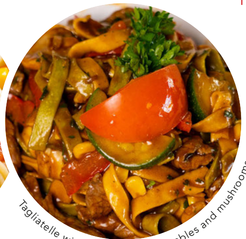
Tagliatelle with beef strips, vegetables and mushrooms