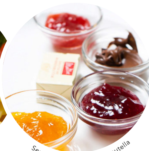
Serving of jam, honey or nutella