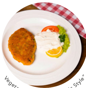
Vegetarian schnitzel „Classic Style“