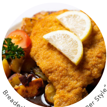
Breaded pork schnitzel „Wiener Style“

Swabian egg noodles | French fries | Croquettes | Pan-fried potatoes | Potato salad | Noodles | Side salad