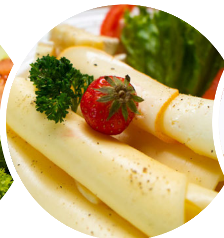
Serving of cheese