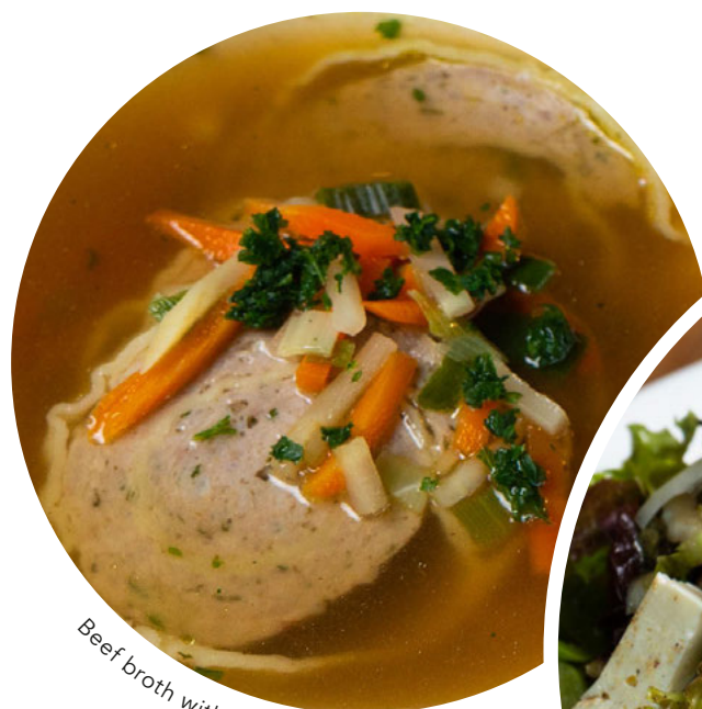
Beef broth with swabian ravioli

We serve fresh baguette slices with all salads.