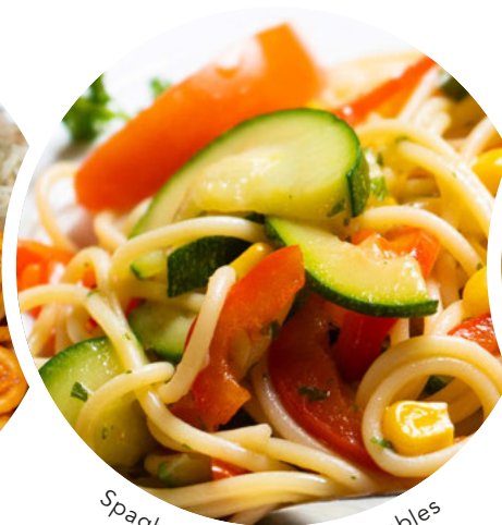
Spaghetti with fresh vegetables